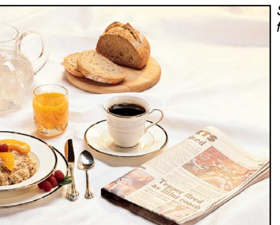
Start your day clean, fresh and clear...

These systems are acceptable for treatment of influent concentrations of no more than 27 mg/L nitrate and 3 mg/L nitrite in combination measured as N and is certified for nitrate/nitrite reduction only for water supplies with a pressure of 280 kPa (40 psig) or greater.