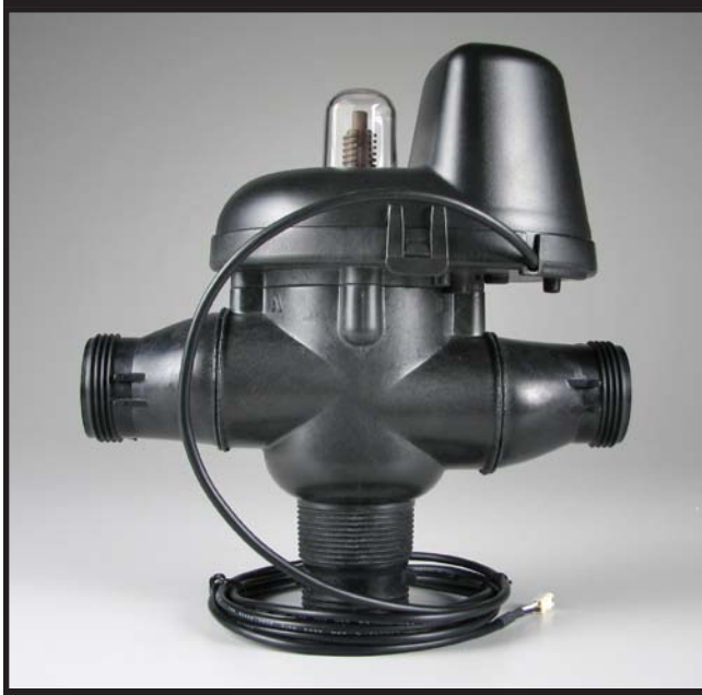
Order No. V3069FF-01 • F x F