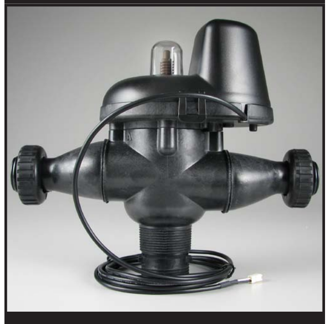
Order No. V3069MM-01 • M x M